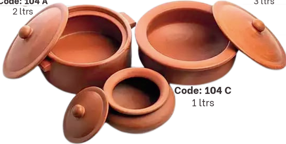
Code: 104 C 1 ltrs